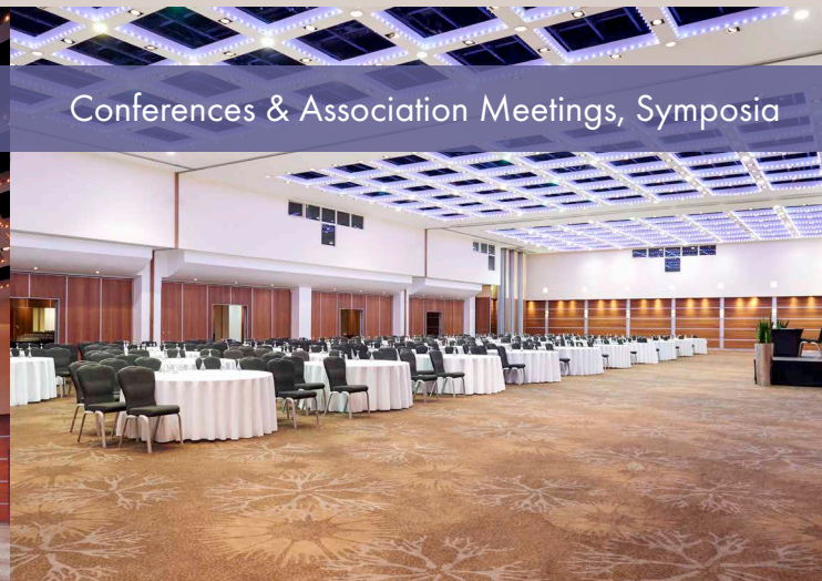
Conferences & Association Meetings, Symposia